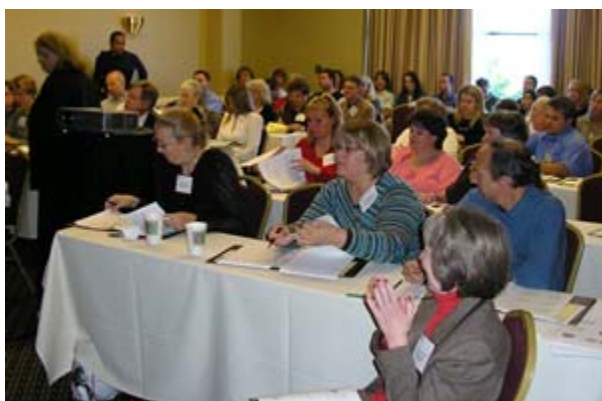
A full house listens to the technology track at the 2005 Fall meeting.