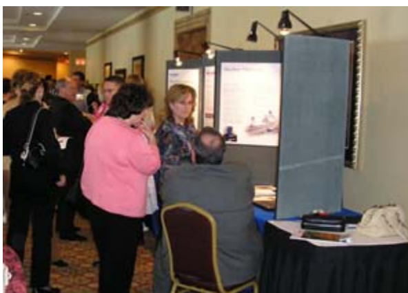
Fall meeting attendees enjoy a refreshment break while visiting with exhibitors.

The 2005 program on image fusing included the following topics and speakers.